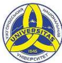
Faculty of Law Uzhhorod National University Ukraine