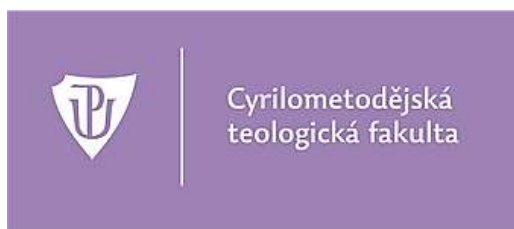
Cyril and Methodius Theological Faculty of Palacky University in Olomouc Czech Republic